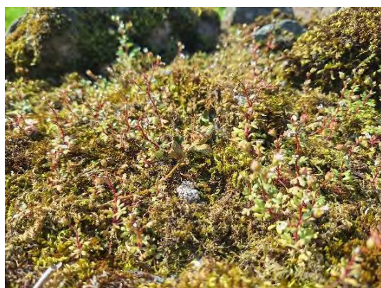
Rue-leaved saxifrage growing with moss on the low roadside wall