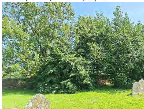
Tree group planted near the eastern boundary wall