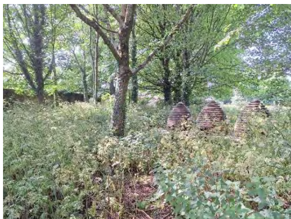
Woodland with bee hives

Grassy verges occur along the boundary walls, under trees and in other areas around graves where the mower can't reach. This adds some diversity in terms of species and structure to the grassland habitat. The unmown areas had hedge woundwort, ground ivy, bush vetch, nettle, cleavers and dog violet.