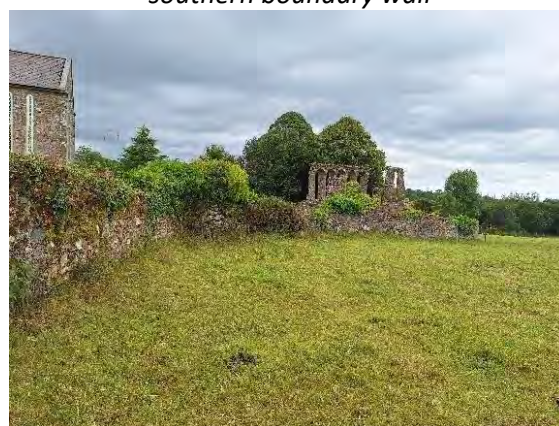
Overgrowth of ivy on the eastern wall