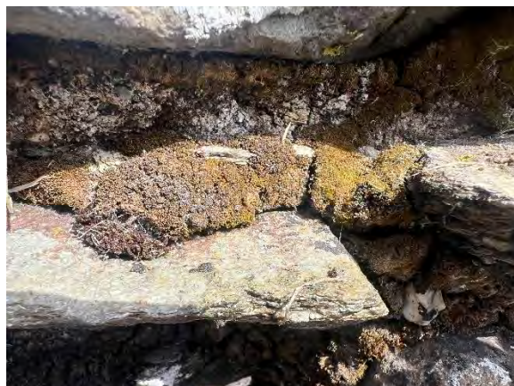
Gynostomum viridulum (close up)