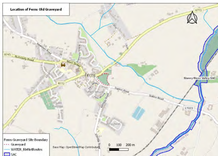
Figure 3-1 Site Location

Ferns Graveyard is located 0.9km west of from the River Bann which is part of the Slaney River Valley SAC (site code: 000781). The location of the site is shown in Figure 2-1.