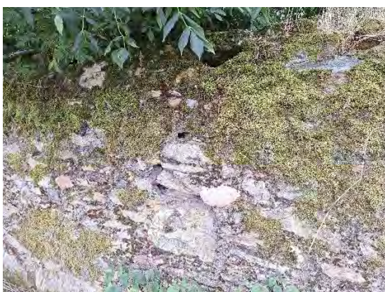
Example of crevices eastern boundary wall field side