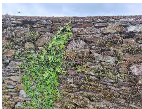
Examples of crevices in southern boundary wall