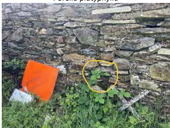
Porella platyphylla southern boundary wall