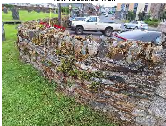
Low boundary wall on roadside