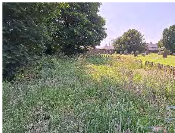
Dry meadow grassland next to woodland