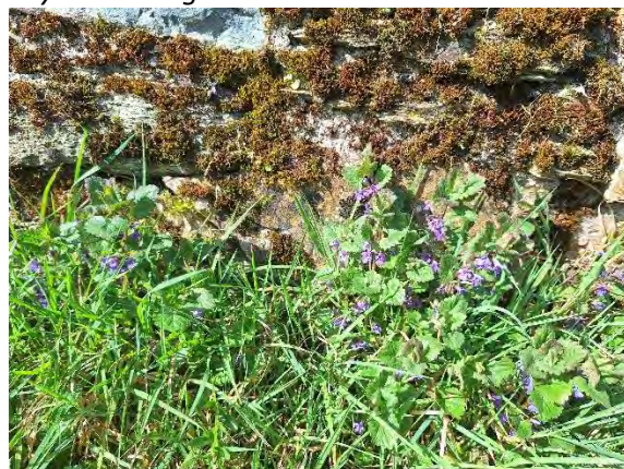
Ground Ivy flowering against the wall