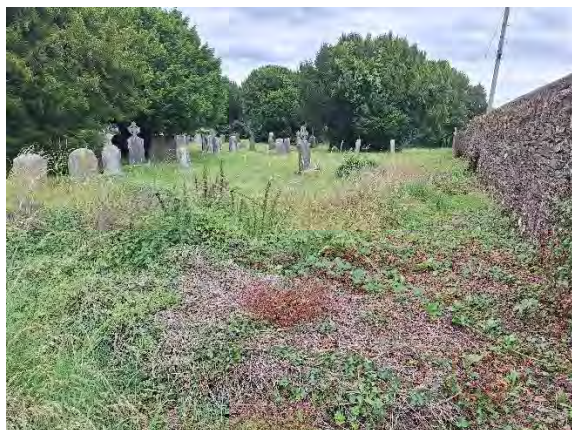
Grassy verges where the mower cant reach