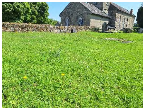
Germander speedwell, common daisy, cat's ear, ribwort plantain, dandelion, self heal