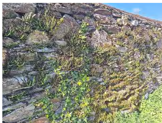
Profuse growth of moss and ferns on the southern boundary wall