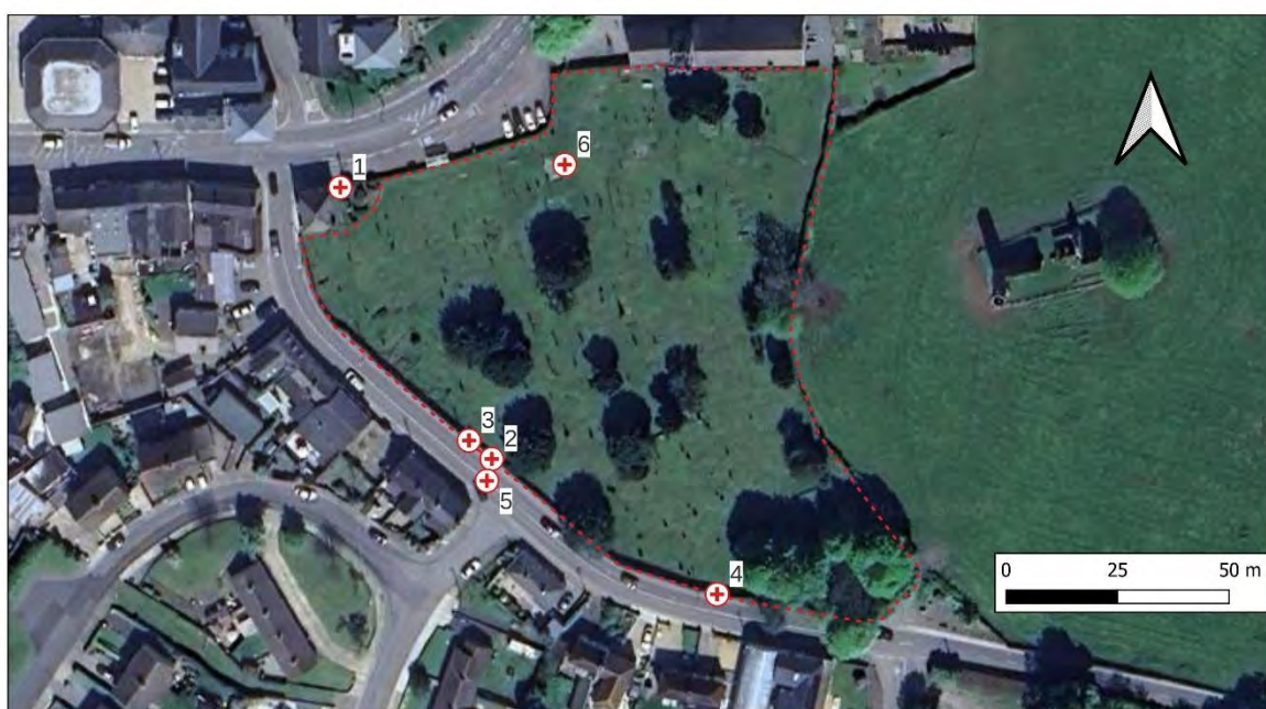
Figure 7-1 Location of rare bryophytes to be protected during works

In addition, the area containing Harebell near the -entrance to the graveyard should be protected with fencing or red tape to protect the area from excessive trampling during the works and / or storage of materials in the area.